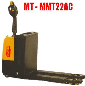
MT - MMT22AC