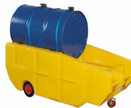
BT30 Drum Trolley 1x205 ltr

ROMOLD LTD ® specialist manufacturers of polyethylene products