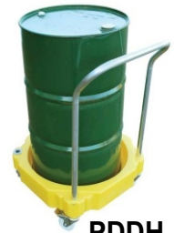
PDDH Poly Drum Trolley with handle for 30ltr container